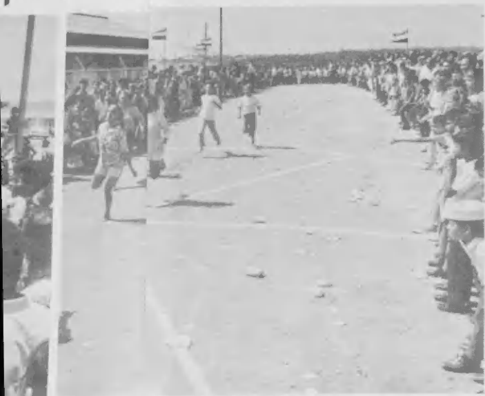
dash - Corremento duro.